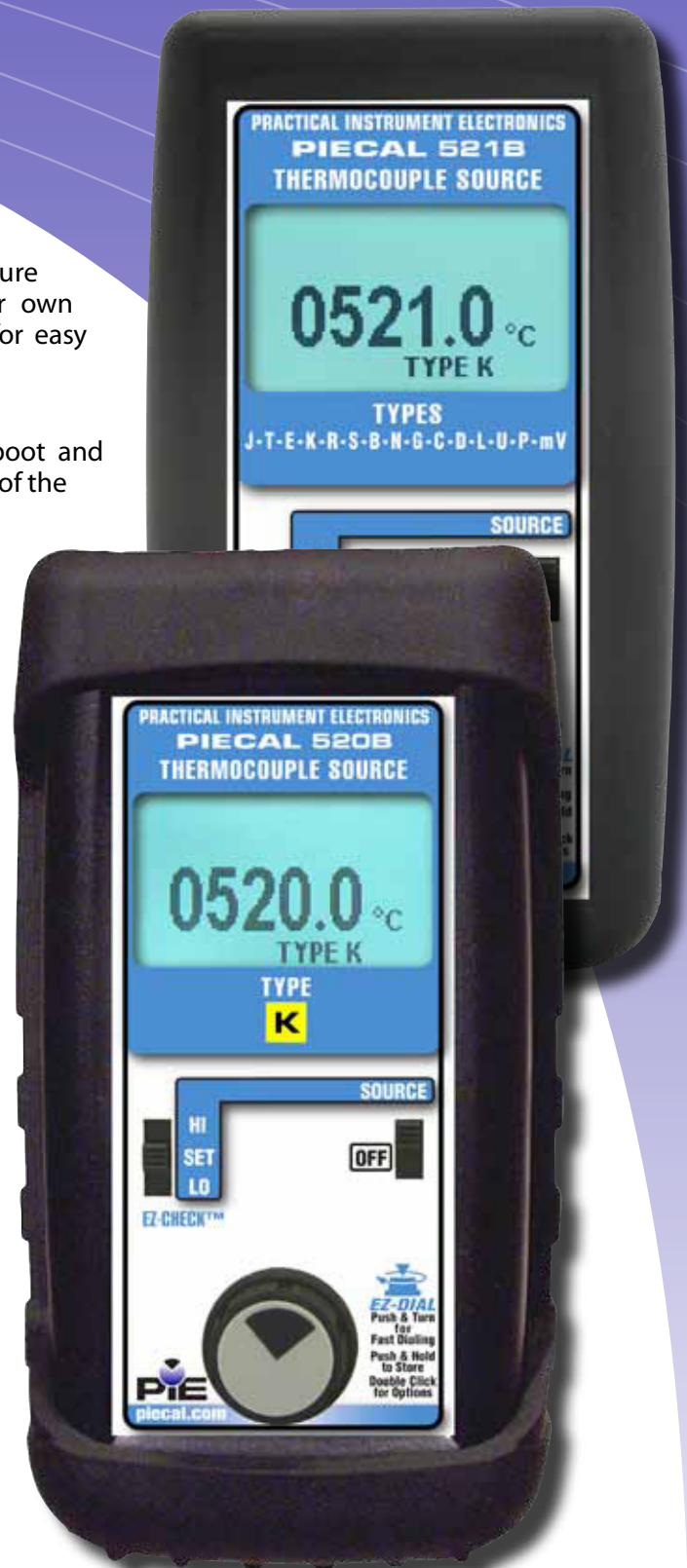
Actual Size (Shown with optional boot)

* PIECAL Calibrators are not manufactured or distributed by Fluke Corp or Altek Industries Inc, manufacturers of Altek Calibrators.